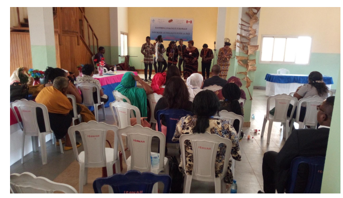
Inter-community dialogue in Bamenda

In addition, we joined a consortium of NGOs in a joint proposal to the United Nations to support IDPs and returning refugees once the current conflict ends. The consortium includes <u>ICA Canada</u>, <u>Children Believe Canada</u>, the <u>Dallaire Institute</u>, South Africa's <u>Graca Machel Foundation</u>, Germany's <u>Engineers Without Borders</u>, and <u>CIC Cameroon</u>. Negotiations with UN agencies is still ongoing, and the consortium plans to submit its proposal in 2021.