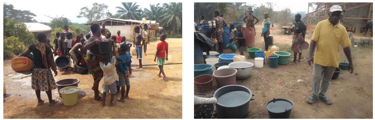
Community members gather as the Kompina Water Project fountains begin to flow.

Breaking Ground is the implementing partner for a water project in the community of Kompina, a locality in the Fiko subdivision 40 km from Douala, Cameroon's economic capital. The project is funded in part by <u>ICA Canada</u> and <u>CIC Cameroon</u> with local community participation. The project aims to provide drinkable water to 20,000 people in this village. The project includes construction of a storage tank of 12 cubic meters, 4 kilometers of water pipe, and 5 water fountains. Much of this project is complete, and Breaking Ground is now preparing to receive the water pump, which is in the Port of Douala. Reflecting Breaking Ground's mission, this project is a community-driven initiative and we, along with our partners ICA and CIC, are working alongside community leaders to help complete this important addition of vital resources to the community.