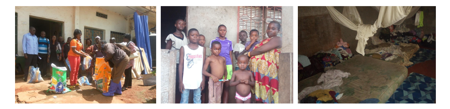
IDPs (left to right): Receiving seeds; Housing crisis with ten living in a single room; rooms without beds or furnishings.