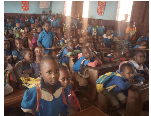
Classroom overcrowded with 150+ children

Cameroon's political crisis has imposed new challenges on education. Children among the IDP have increased the number of students in the already overcrowded classrooms in the host communities. While the standard in Cameroon is 40 students per classroom, recent studies revealed that there are 176 students per teacher in many school classes. Furthermore, in rural areas, only one third of teachers are paid by the state, where the other two thirds of teachers are hired and paid by the local parent-teacher association (PTA) rather than by local. Most of these teachers are not trained and are poorly prepared to handle the influx of IDP students.